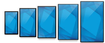
Elo's Interactive Digital Signage (IDS) products are available in 32" to 65" and include the thinnest (3-3.5") all-in-one commercial touch displays on the market.

This application note discusses all local interfaces to the IDS display. Two methods are possible: over the video signal using the VESA DDC/CI protocol and over USB using the MDC protocol. The VESA protocol enables the full functionality found in the Elo Display Device Client while the MDC protocol provides backward compatibility to the 00 series remote management features.