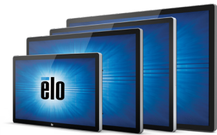
Elo's Interactive Digital Signage (IDS) products are available in 32" to 70" and include the thinnest (3-3.5") all-in-one commercial touch displays on the market.

This application note discusses all local interfaces to the IDS display. Two methods are possible: over the video signal using the VESA DDC/CI protocol and over USB using the MDC protocol. The VESA protocol enables the full functionality found in the Elo Display Device Client while the MDC protocol provides backward compatibility to the 00 series remote management features.