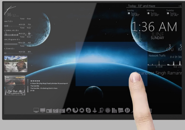
Frontside of LCM module