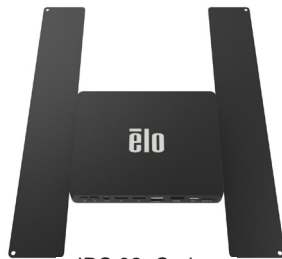
IDS 02- Series mounting brackets