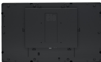
New sleek finished enclosure

Select from a wide range of sizes—from 10" to 27"—to fit in any gaming environment. Other Elo products extend the range to 70"